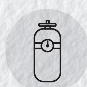
Gas, propane, or Oil Hot Water Boilers