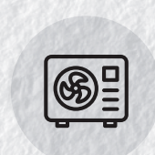
Advanced Main Air Circulating Fan