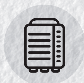
Central Air Conditioning