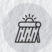
Non-solar water heaters